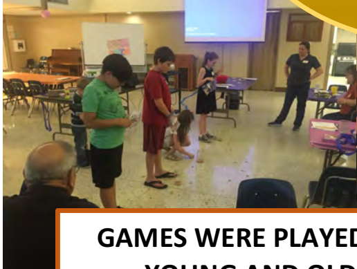
GAMES WERE PLAYED BY YOUNG AND OLD