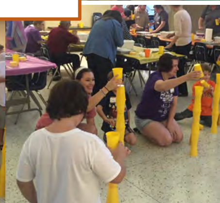
63 PEOPLE BETWEEN THE TWO NIGHTS HAD EVENINGS FILLED WITH FUN, LAUGHTER AND GOOD FAMILY FELLOWSHIP