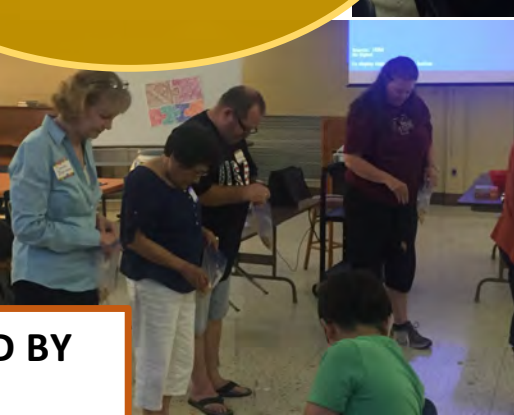
STEPPING STONE CRAFT