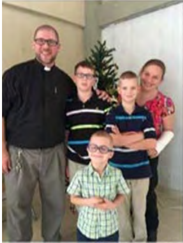
(Excerpts from the January 2016 newsletter)