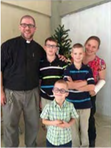
(Excerpts from the January 2016 newsletter)